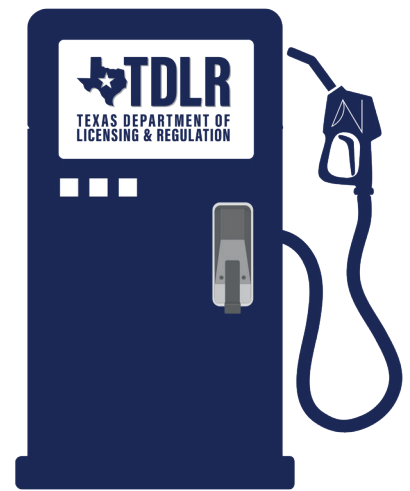
Multi-Product Device b Fee: $93 / nozzle

Total Fee / Cabinet: $248 (as illustrated above): 2 sides x ($31/device + $93/device) = $248